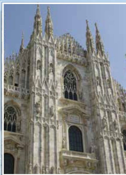
Duomo of Milan

But to many of our travelers, Italy itself is a work of art. We'll admire her natural beauty with seven nights in Lake Como, where aboard a private launch we'll explore the countless gorgeous villas, villages, and gardens that line Lake Como's shoreline. We'll tour the famed 18th-century Villa Carlotta and the Villa Balbianello with its lakeside gardens and outstanding collections of exotic art and antique furniture. We'll also enjoy time to explore the renowned lakeside town of Bellagio as well as Como. With our excellent four-star hotel in Como and superb leadership throughout, this holiday in Lombardy, Italy's richest region, is sure to delight.