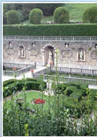
The Last Supper