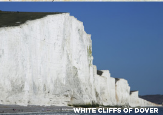
WHITE CLIFFS OF DOVER