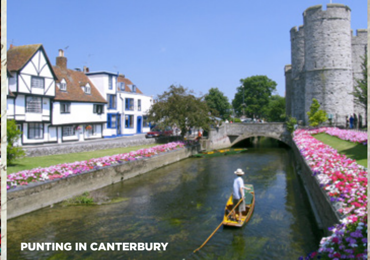
PUNTING IN CANTERBURY