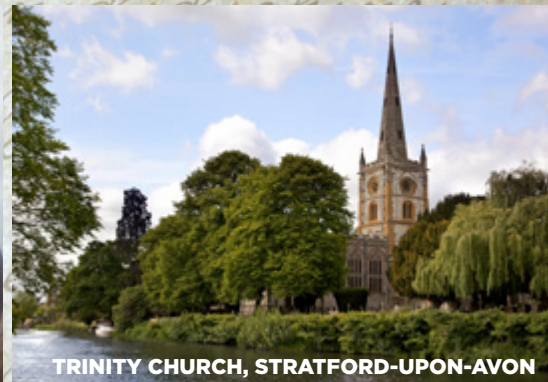
TRINITY CHURCH, STRATFORD-UPON-AVON