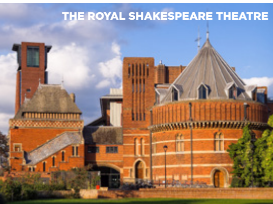
THE ROYAL SHAKESPEARE THEATRE

See where it all began at Shakespeare's childhood home in Henley Street; the family cottage of his wife, Anne Hathaway; the farm where his mother was raised; Hall's Croft, where his daughter lived after 1507; and Holy Trinity Church, where he worshipped, was baptized, and was ultimately buried. After lunch at a local pub, venture into the rolling hills that surround Stratford to see Kenilworth Castle, one of England's finest ruined castles, and where a celebration took