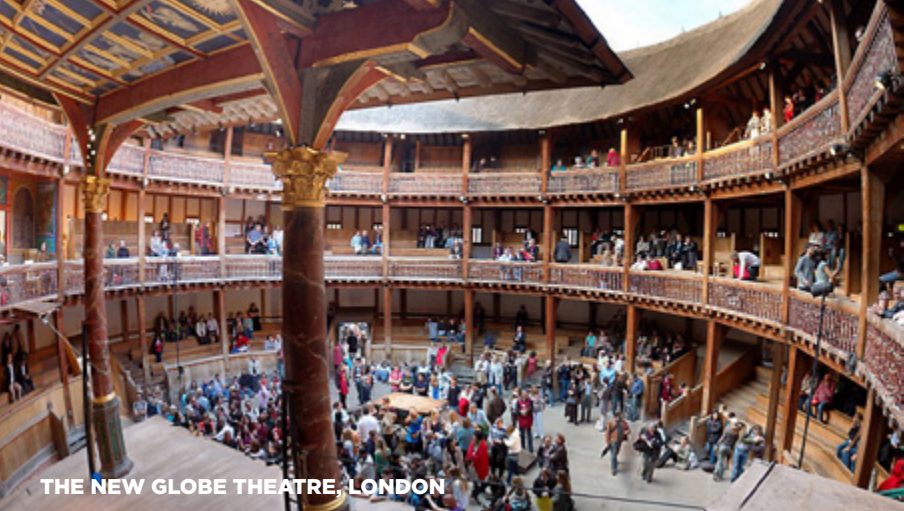
THE NEW GLOBE THEATRE, LONDON