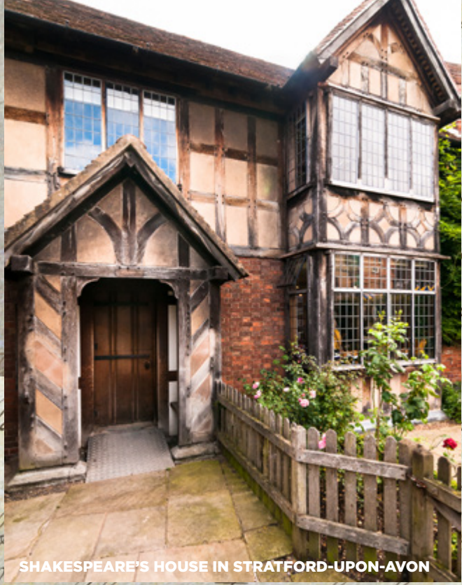
SHAKESPEARE'S HOUSE IN STRATFORD-UPON-AVON