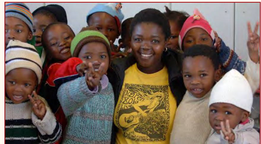
Tour the District Six Museum and Langa Township, the oldest apartheid township in the Cape.