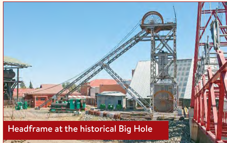
Headframe at the historical Big Hole