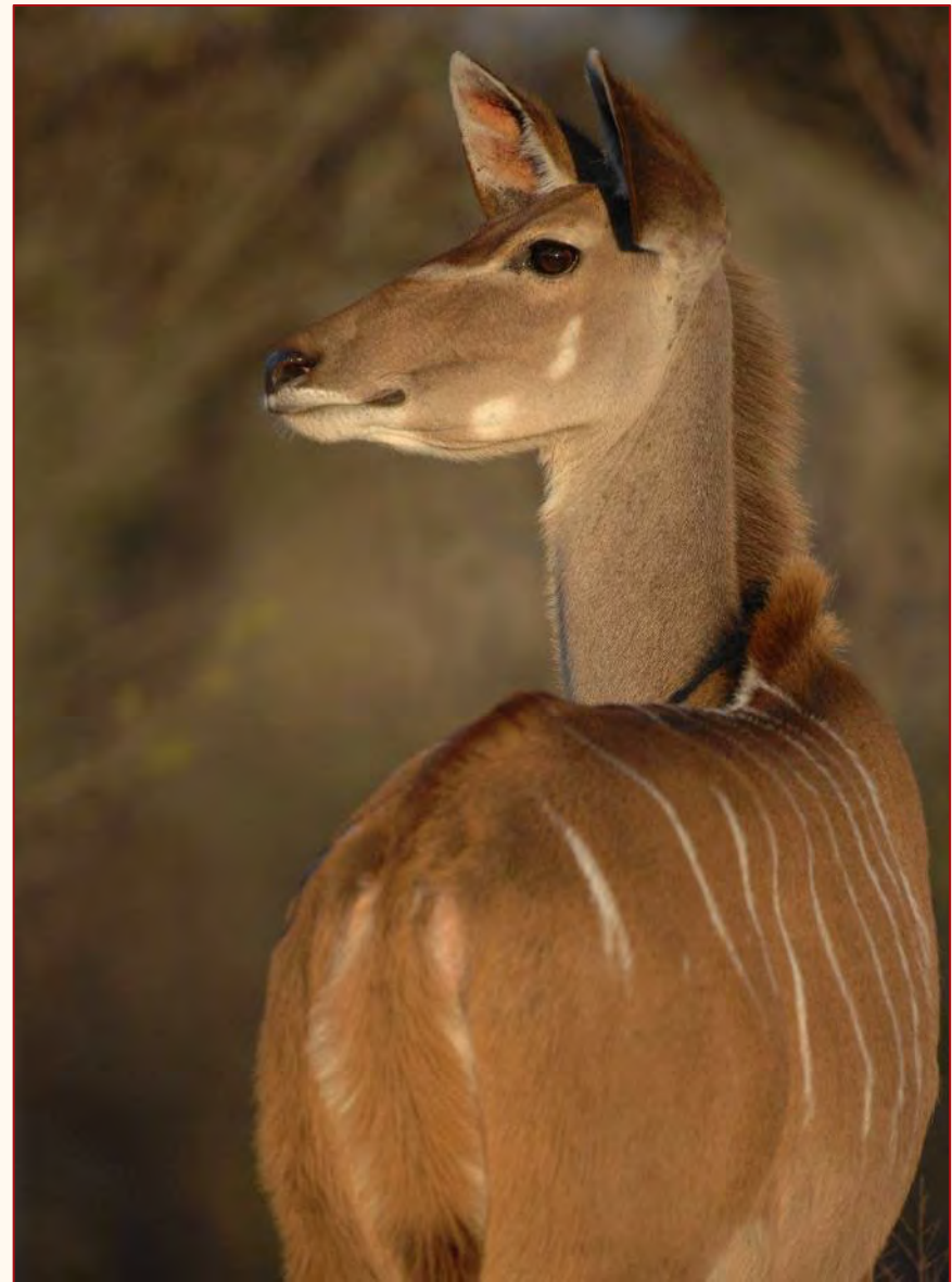
Beautiful kudu ... male & female