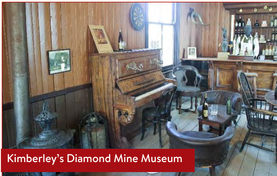
Kimberley's Diamond Mine Museum