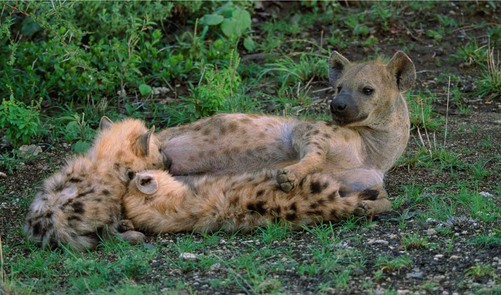
Hyena and young