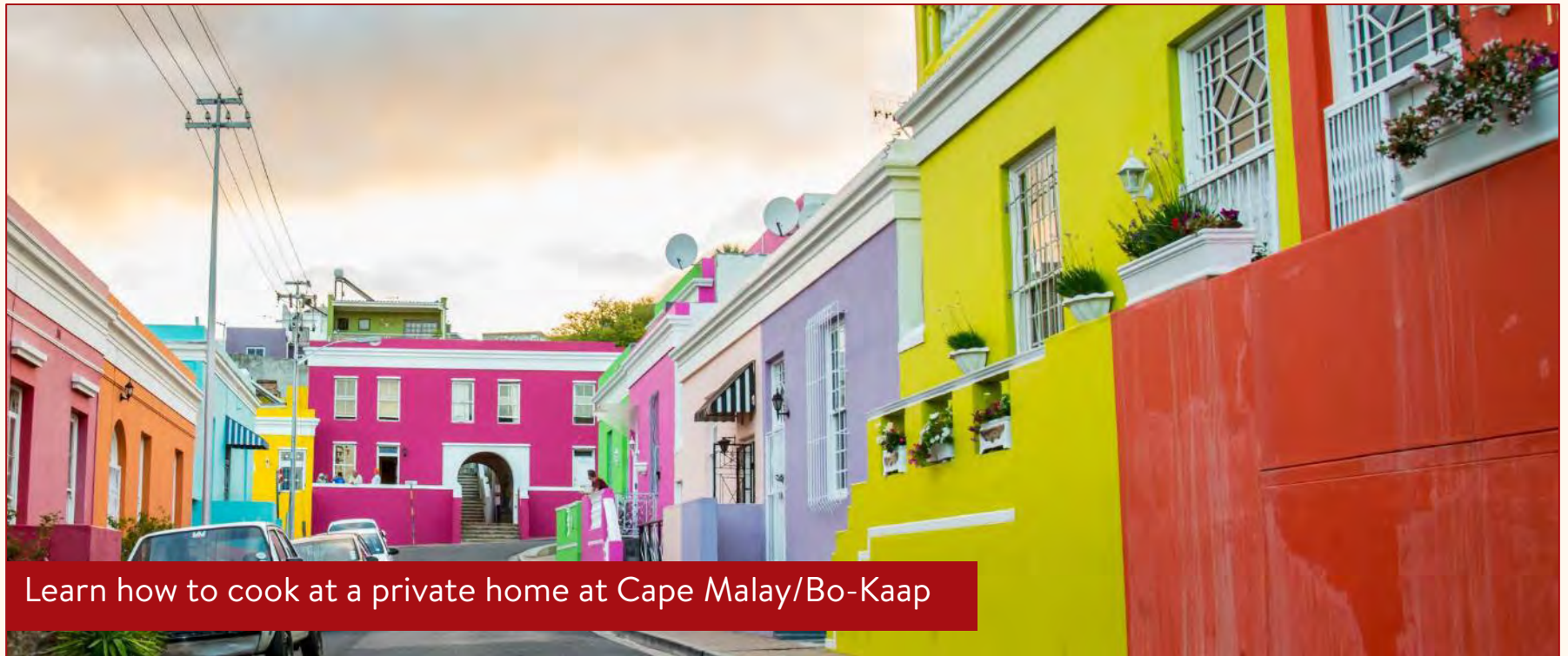
Learn how to cook at a private home at Cape Malay/Bo-Kaap