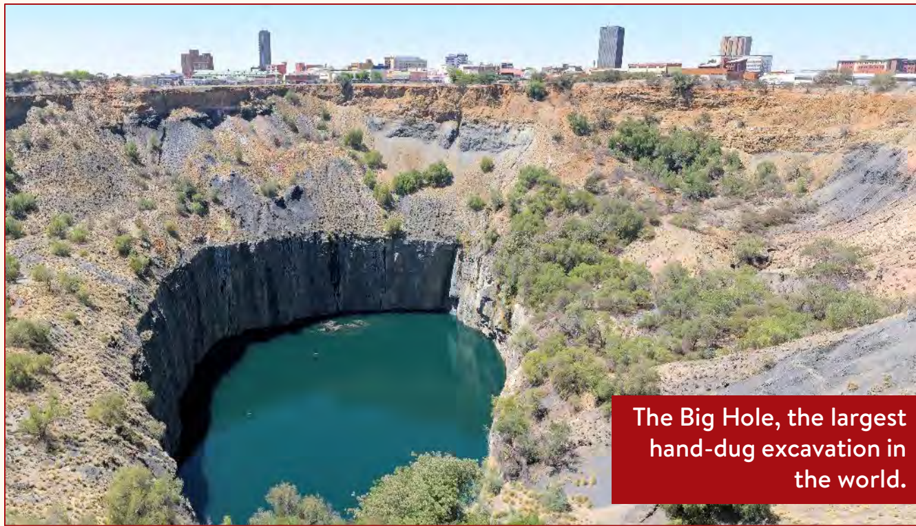
The Big Hole, the largest hand-dug excavation in the world.