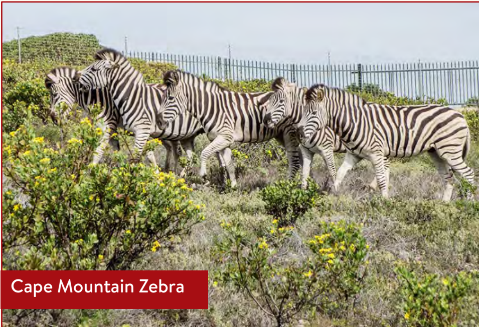
Cape Mountain Zebra