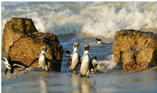
African penguins at Boulders Beach

“I believe that South Africa is the most beautiful place on earth. Admittedly, I am biased, but when you combine the natural beauty of sunny South Africa with the friendliness and cultural diversity of our people, and the fact that the region is a haven for Africa’s most splendid wildlife, then I think even the most scrupulous critic would agree that we have been blessed with a truly wonderful land.”