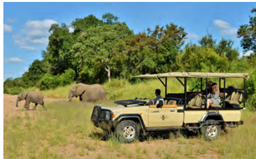
Encounter elephants during your game drive in Kruger

Today you land in the USA bringing with you the memories of all the wonderful sights of Southern Africa.