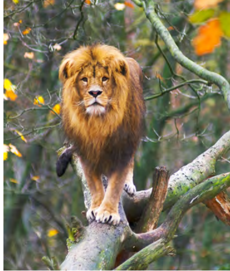
Lion on tree in Kruger National Park