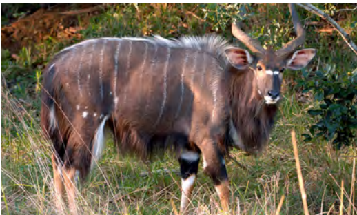
An elegant Nyala Bull in tall grass

South Africa is full of record-breaking animals. It's where you'll find the largest land mammal (elephant), the largest bird (ostrich), the tallest animal (giraffe), the largest fish (whale shark), the largest reptile (leatherback turtle), the fastest land mammal (cheetah) and the largest antelope (eland).