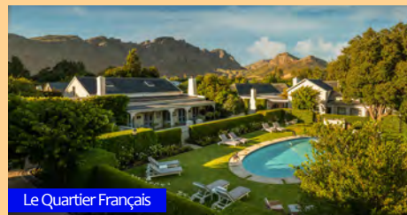
Le Quartier Français