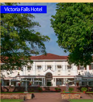
Victoria Falls Hotel