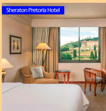
Sheraton Pretoria Hotel