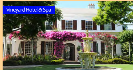
Vineyard Hotel & Spa

Rovos Rail in Pullman suites: Step aboard the wood paneled coaches – classics remodeled and refurbished to mint condition – and enjoy fine cuisine in five-star luxury. The rebuilt sleeper coaches contain beautiful suites, offering every modern convenience and comfort.