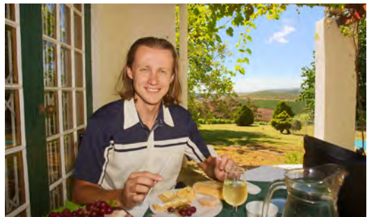
Wine tasting in a South African vineyard