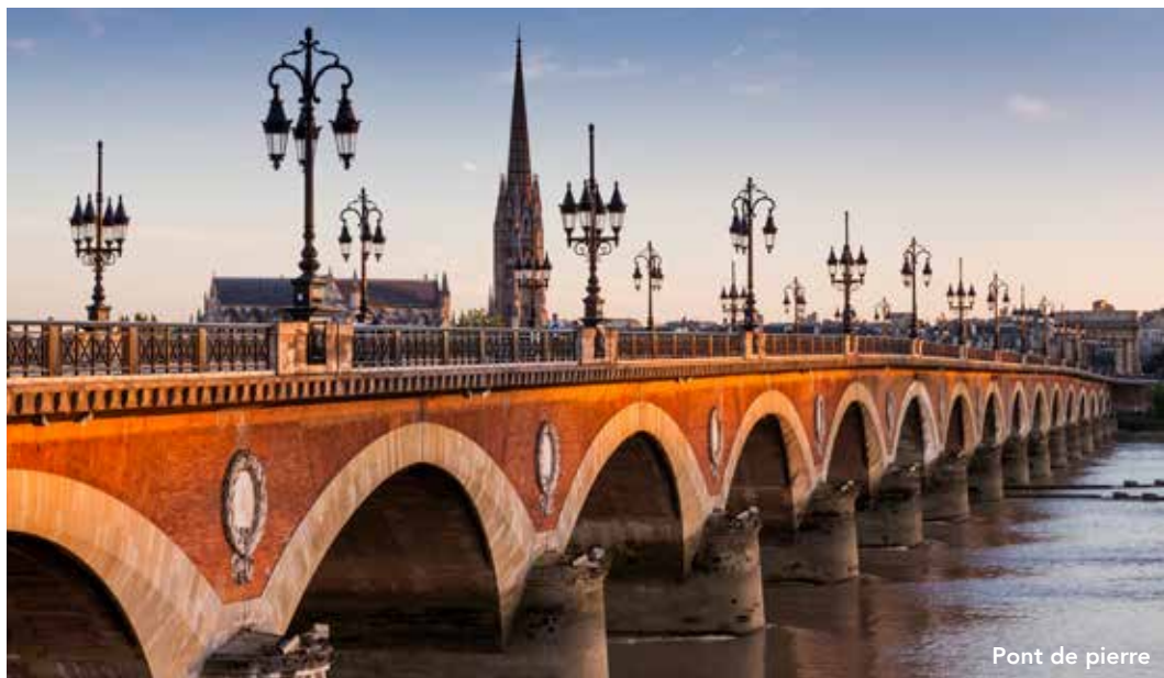
Pont de pierre