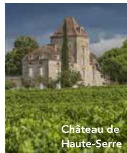
Château de Haute-Serre