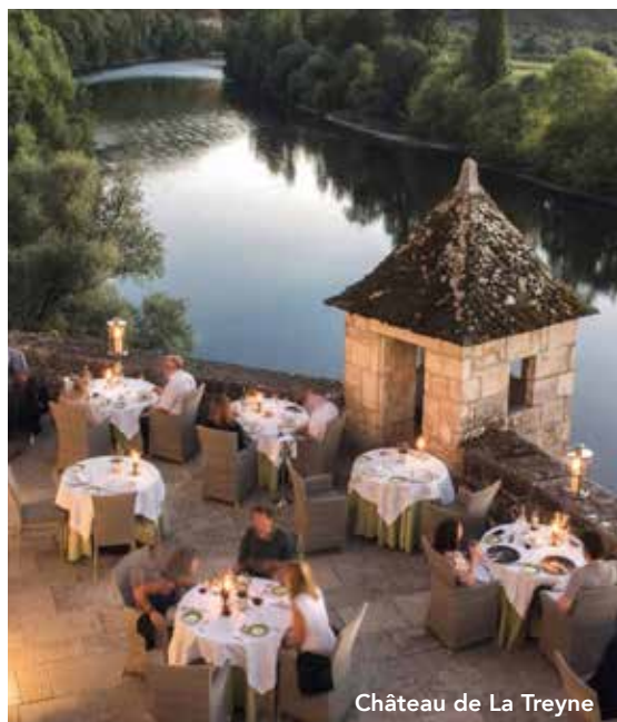
Château de La Treyne