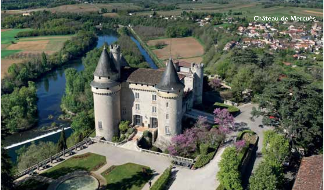
Château de Mercuès

Unwind with a stay at the beautiful 13th-century Château de Mercuès, a Relais & Châteaux property with a Michelin-star restaurant. Built on a rocky promontory, the château’s elevated location offers exceptional views from every vantage point. As the summer residence of the Counts and Bishops of Cahors for seven centuries, guests enjoy an authentic immersion in the history of France.