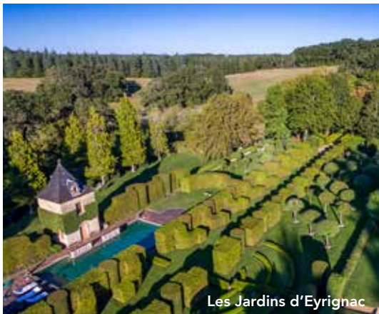
Les Jardins d'Eyrignac