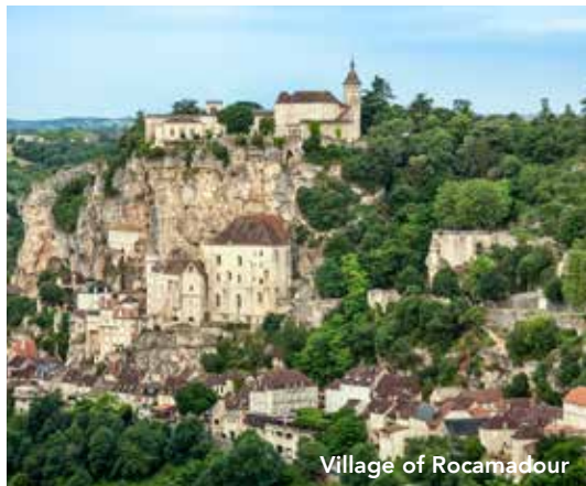
Village of Rocamadour

Activity Level: Guests should be able to enjoy two hours or more of walking, be sure-footed on cobbled surfaces, and walk up and down hillsides and stairs without assistance. Due to the structure of some buildings, facilities for the disabled may be limited. Dexterity to use kitchen tools and participate in lessons is not necessary, but adds to the enjoyment of this program.