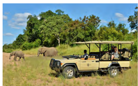
Encounter elephants during your game drive in Kruger

transfer to the airport for your departure flight