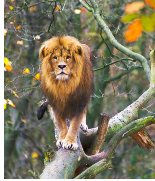
Lion on tree in Kruger National Park