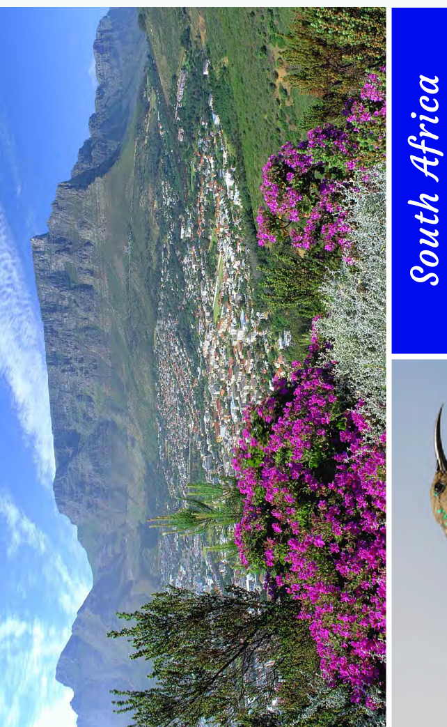
Classic Escapes protects our planet.

204 W. Washington St. Washington and Lee University Office of Lifelong Learning Lexington, VA 24450 Fax: (540) 458-8478