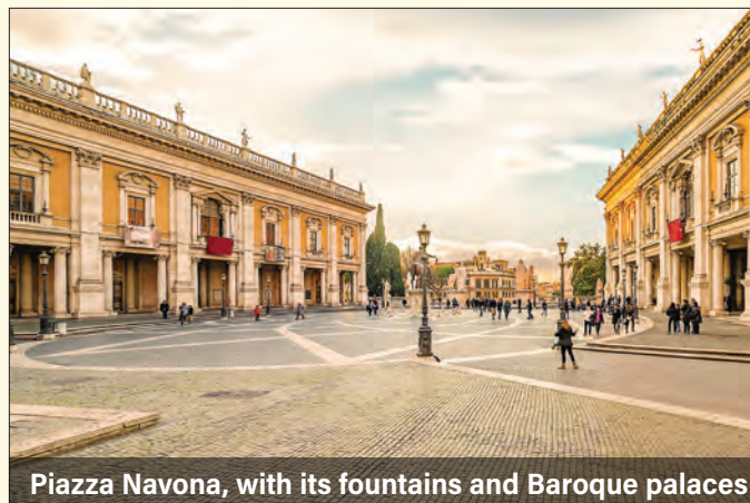
Piazza Navona, with its fountains and Baroque palaces