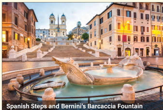
Spanish Steps and Bernini's Barcaccia Fountain

For more information, please call W&L's Office of Lifelong Learning at 540.458.8723