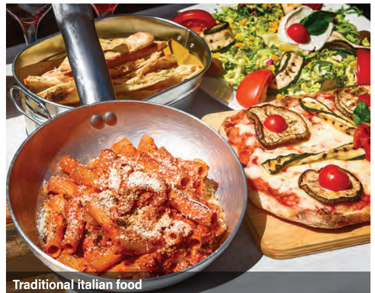
Traditional Italian food

For more information, please call W&L's Office of Lifelong Learning at 540.458.8723