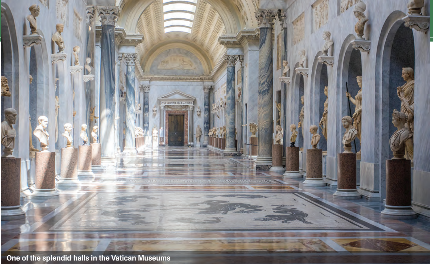
One of the splendid halls in the Vatican Museums

devoted to regional specialties, with special focus on pasta. Feast on your creations for lunch. The balance of the day is at leisure. (B,L)