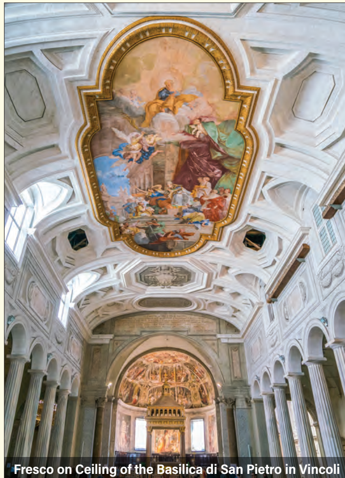
Fresco on Ceiling of the Basilica di San Pietro in Vincoli