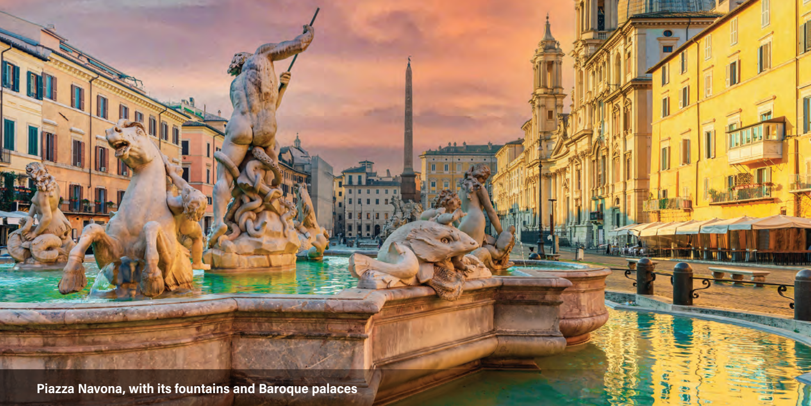
Piazza Navona, with its fountains and Baroque palaces