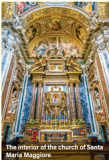
The interior of the church of Santa Maria Maggiore

NOT INCLUDED: International airfare; travel insurance; expenses of a personal nature; any items not mentioned in the Itinerary and the Program Inclusions.