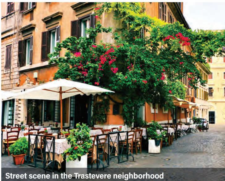
Street scene in the Trastevere neighborhood

After breakfast at the hotel, transfer to the airport for flights homeward. (B)