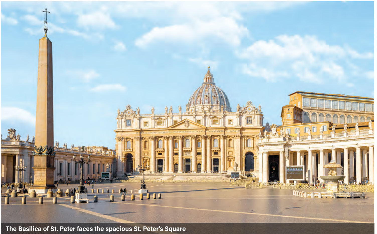
The Basilica of St. Peter faces the spacious St. Peter's Square