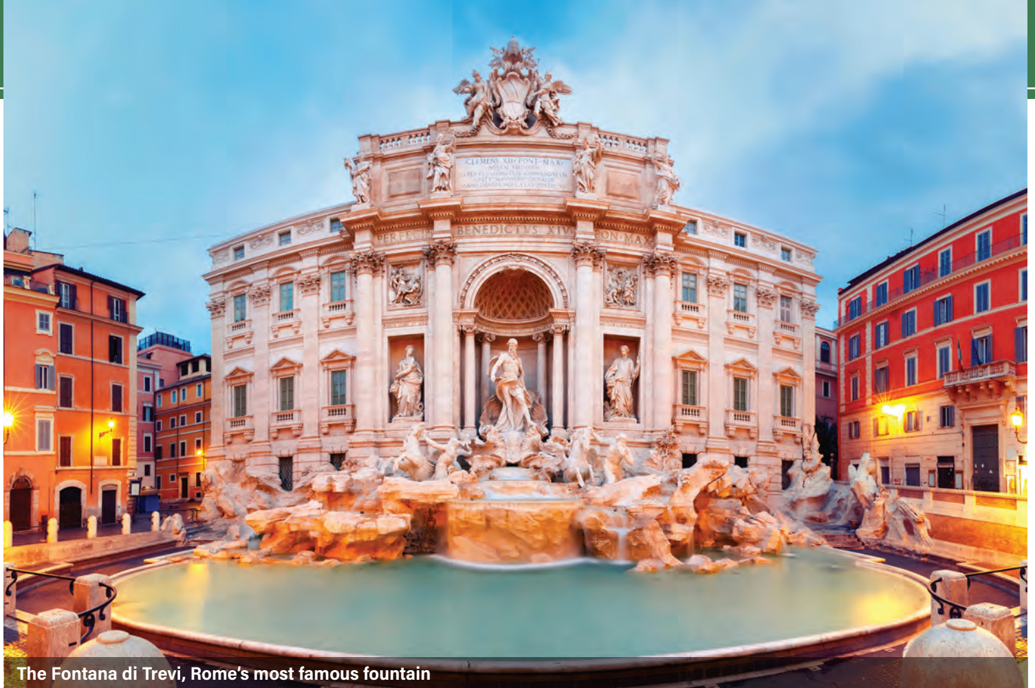
The Fontana di Trevi, Rome's most famous fountain