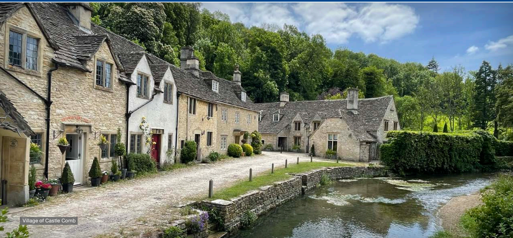
Village of Castle Comb