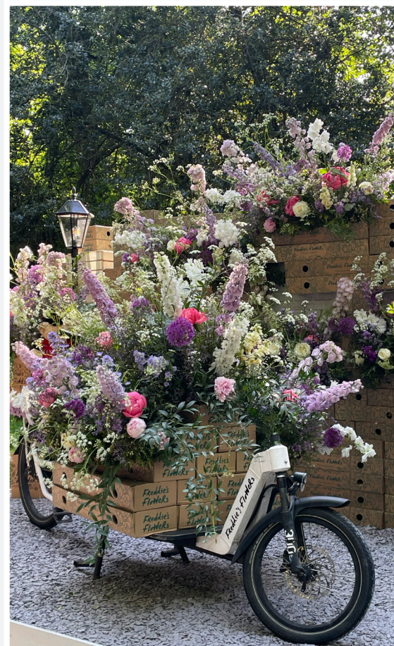
Chelsea Flower Show