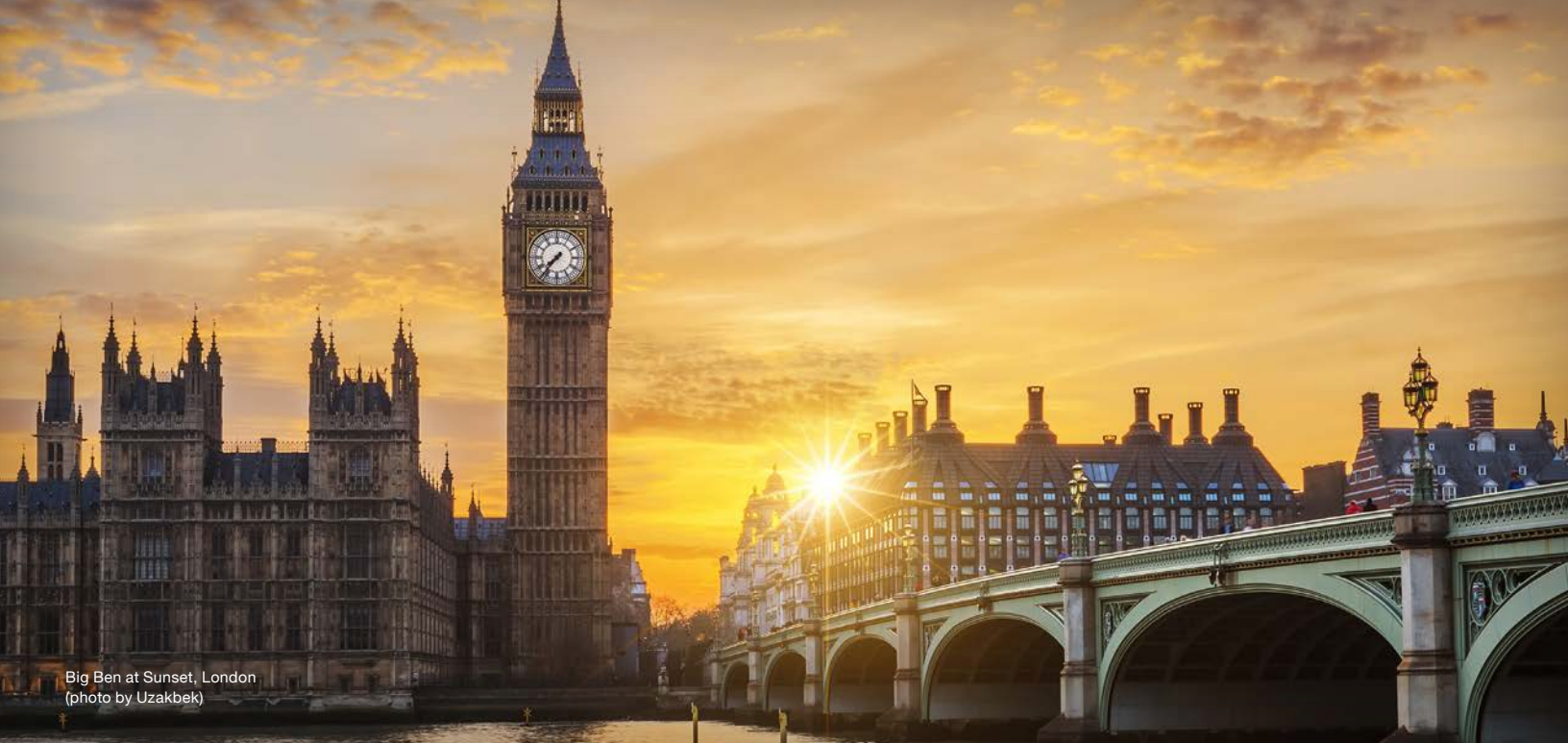
Big Ben at Sunset, London