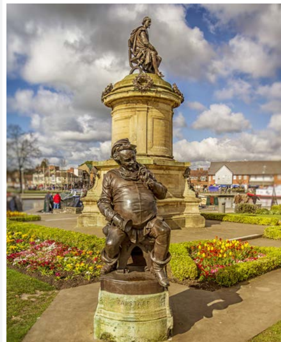
Falstaff and Shakespeare, Stratford-upon-Avon