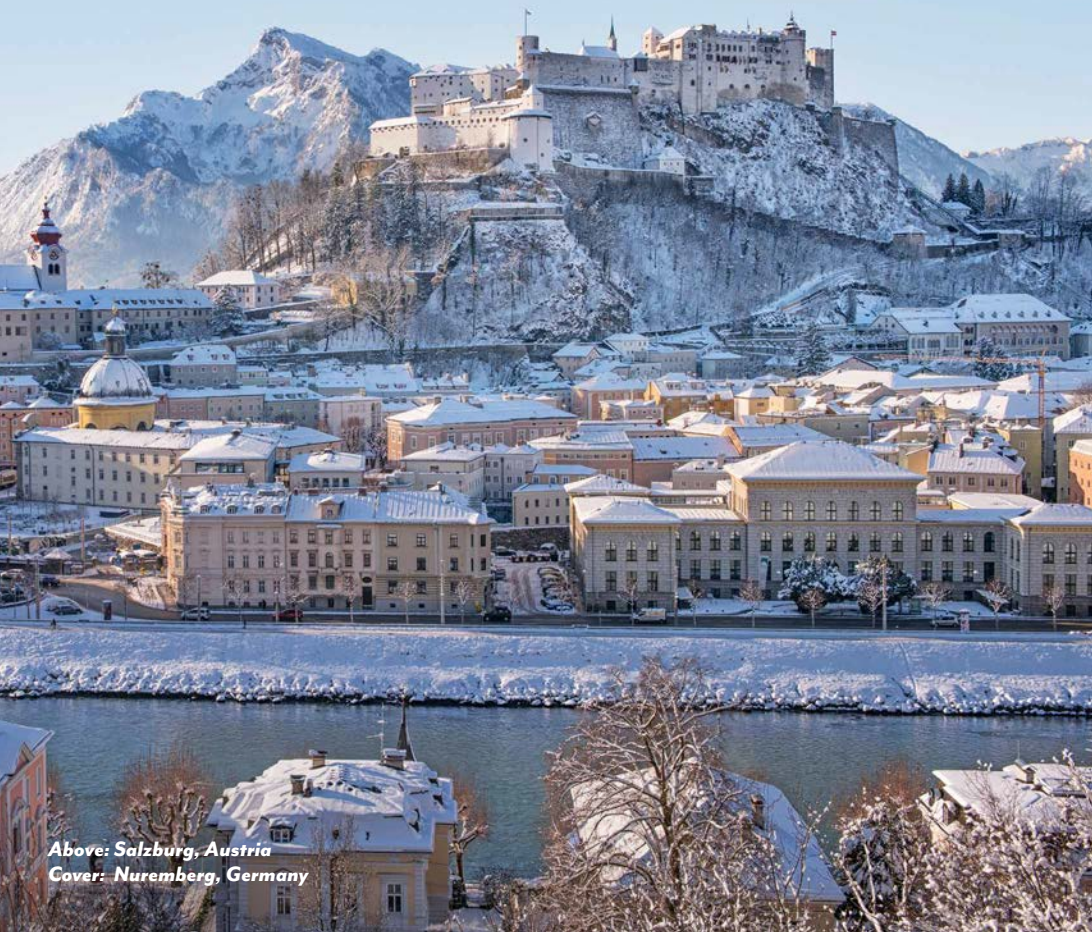
Above: Salzburg, Austria Cover: Nuremberg, Germany