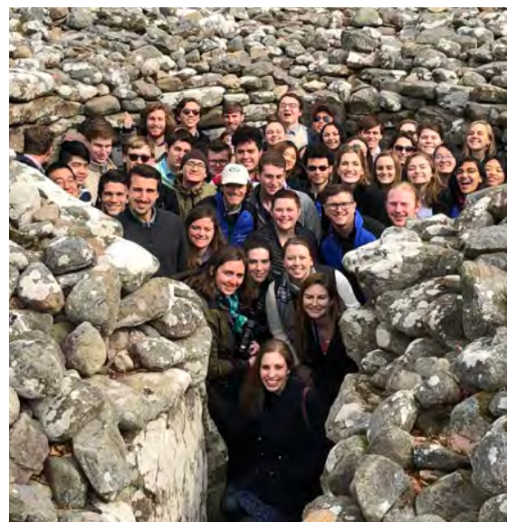
The University Singers share body heat at Clava Cairns in Scotland. (contributed photo)