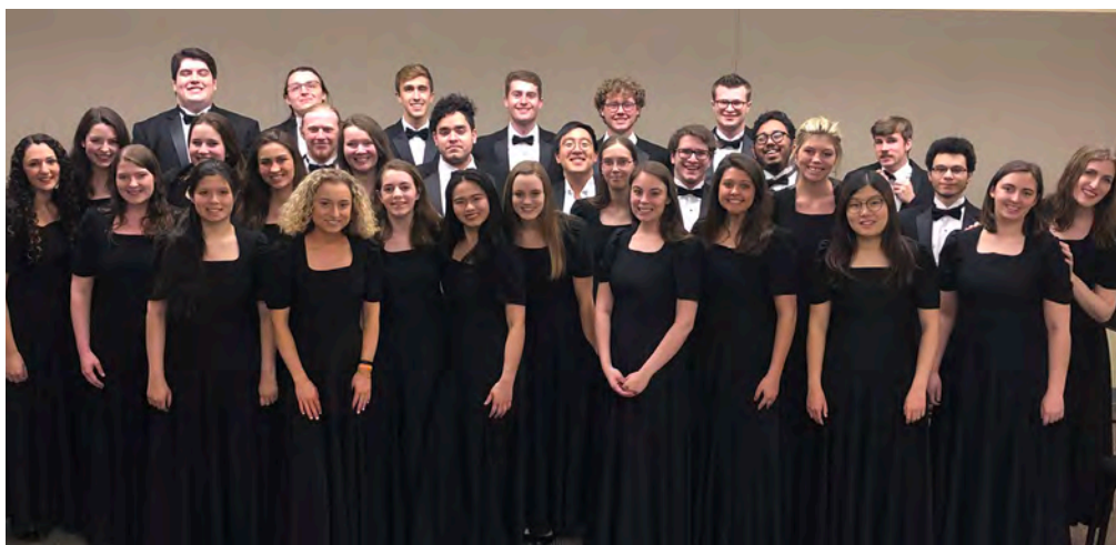
Cantatrici and Glee Club prior to the Winter Choral Concert

The University Singers had a successful tour kickoff concert before leaving for their spring break tour of Scotland. Though the choir faced multiple days of flight cancellations before arriving, the students bonded during their time together, taking advantage of every opportunity they had to sing. The choir sang in airports, restaurants on the streets of Edinburgh, at TopGolf and more. Tour highlights included performing in an audience-surrounding formation in Rosslyn Chapel, touring Edinburgh castle, visiting and singing in Stirling Chapel and performing with the St. Salvatore Chapel Choir in an Evensong Service at the University of St. Andrews. The choir was