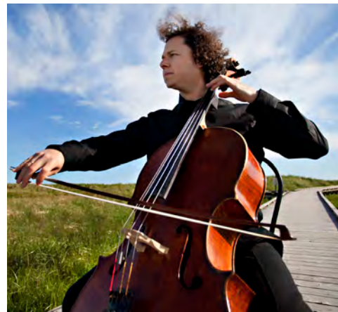
Matt Haimovitz