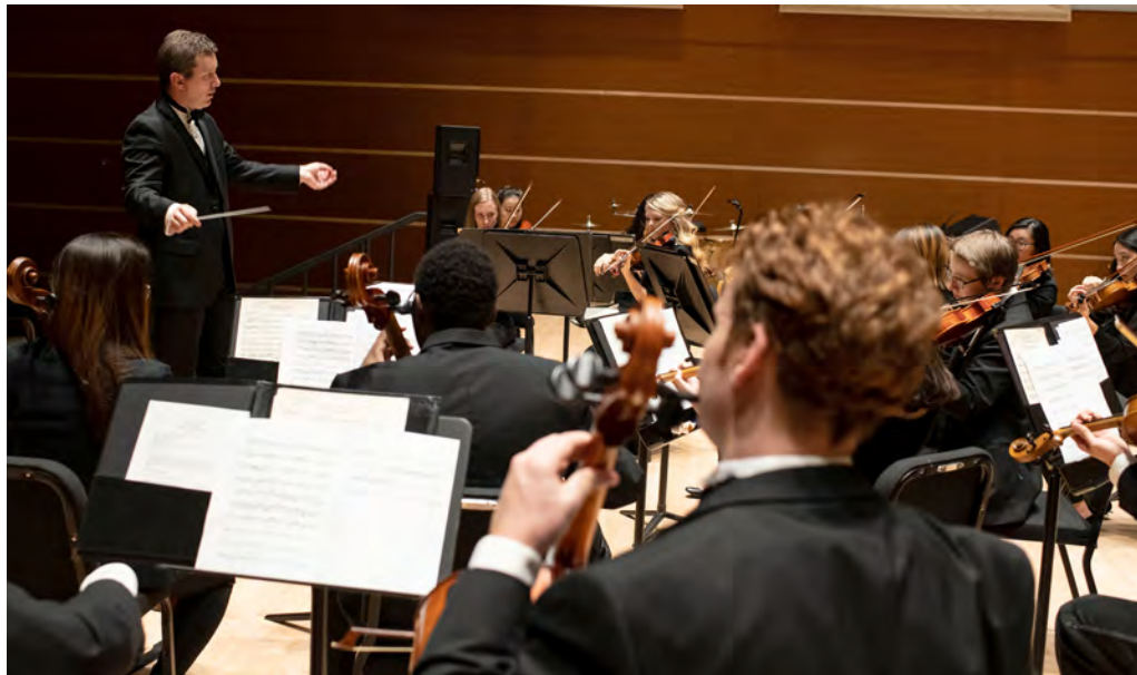
University Orchestra Fall Concert