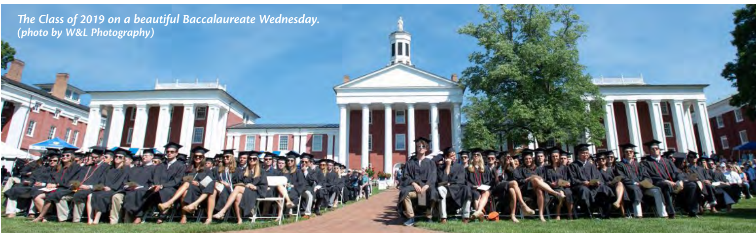
The Class of 2019 on a beautiful Baccalaureate Wednesday.