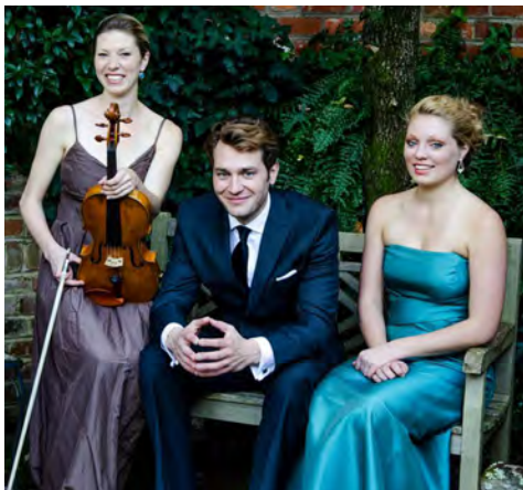
Marinus Ensemble

The Marinus Ensemble returns to W&L for a concert on September 28, the theme of which is “Nationalism.” Through works by Spaniard, Joaquín Turina, Swiss-born American Jewish composer, Ernest Bloch, and Russian, Dmitri Shostakovich, we will examine how composers manifest the traits of their respective cultures in their