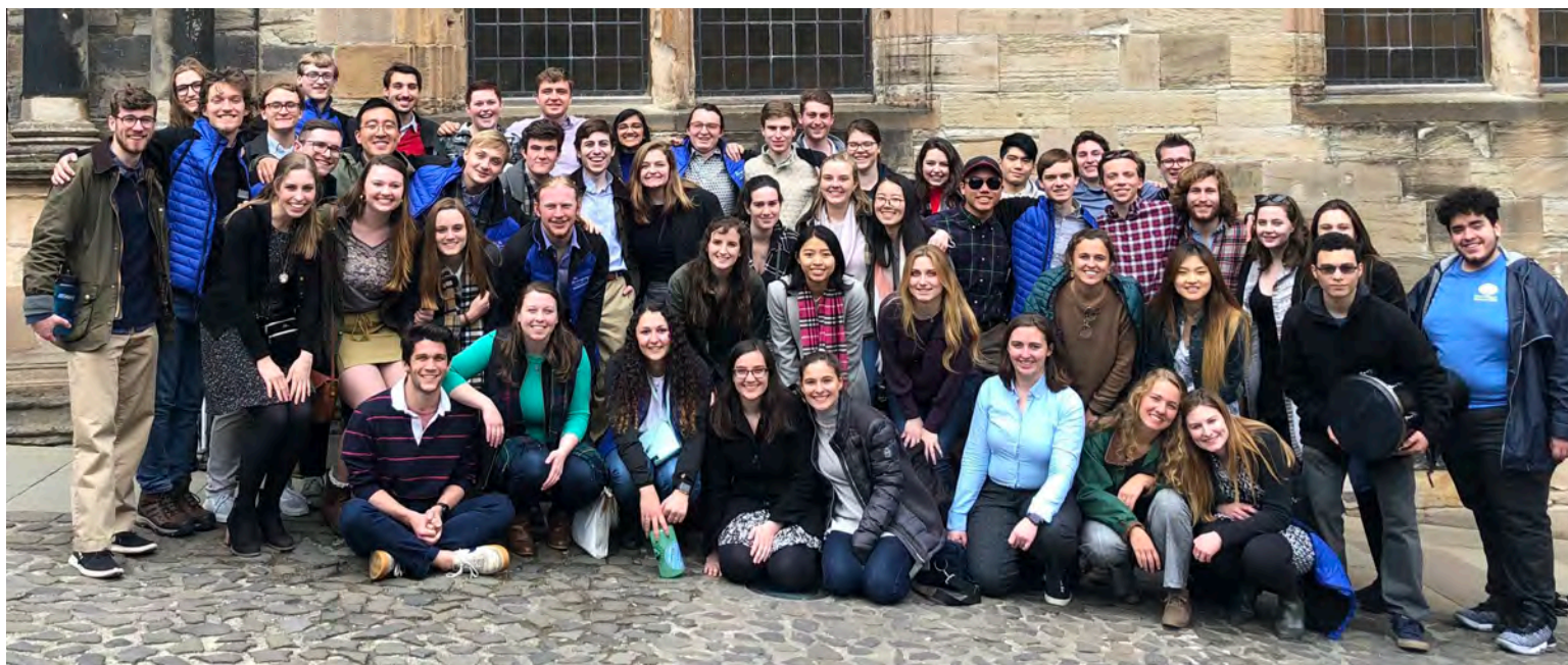
University Singers at Stirling Chapel