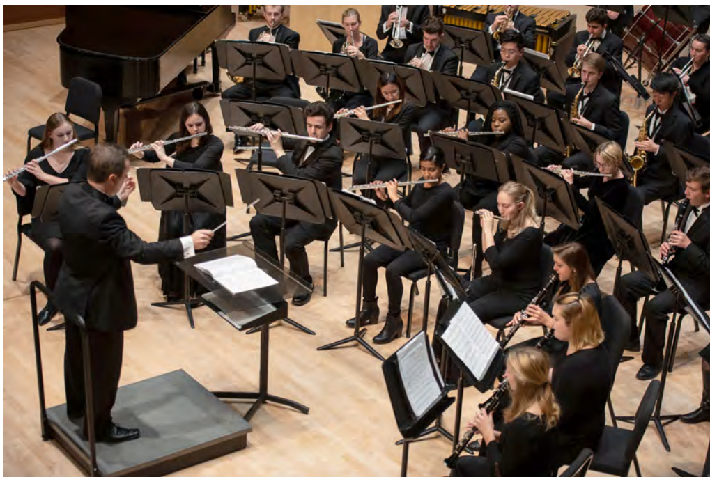
University Wind Ensemble Fall Concert