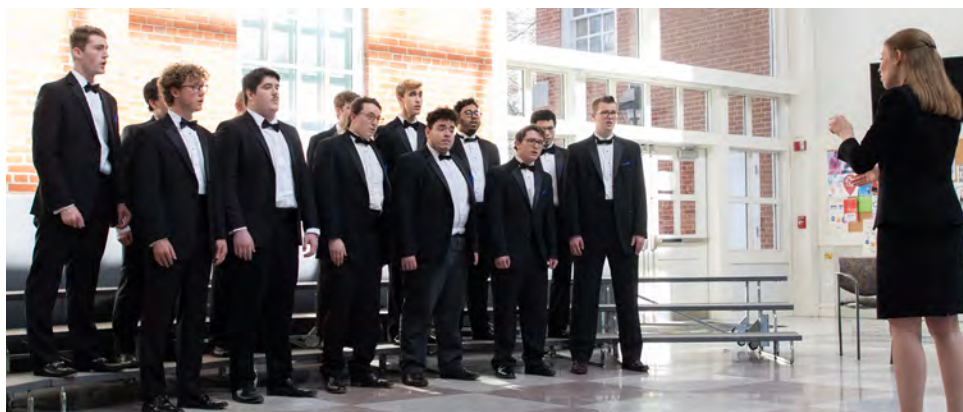
The Glee Club sings in the Great Hall of the Science Center during SSA 2019.